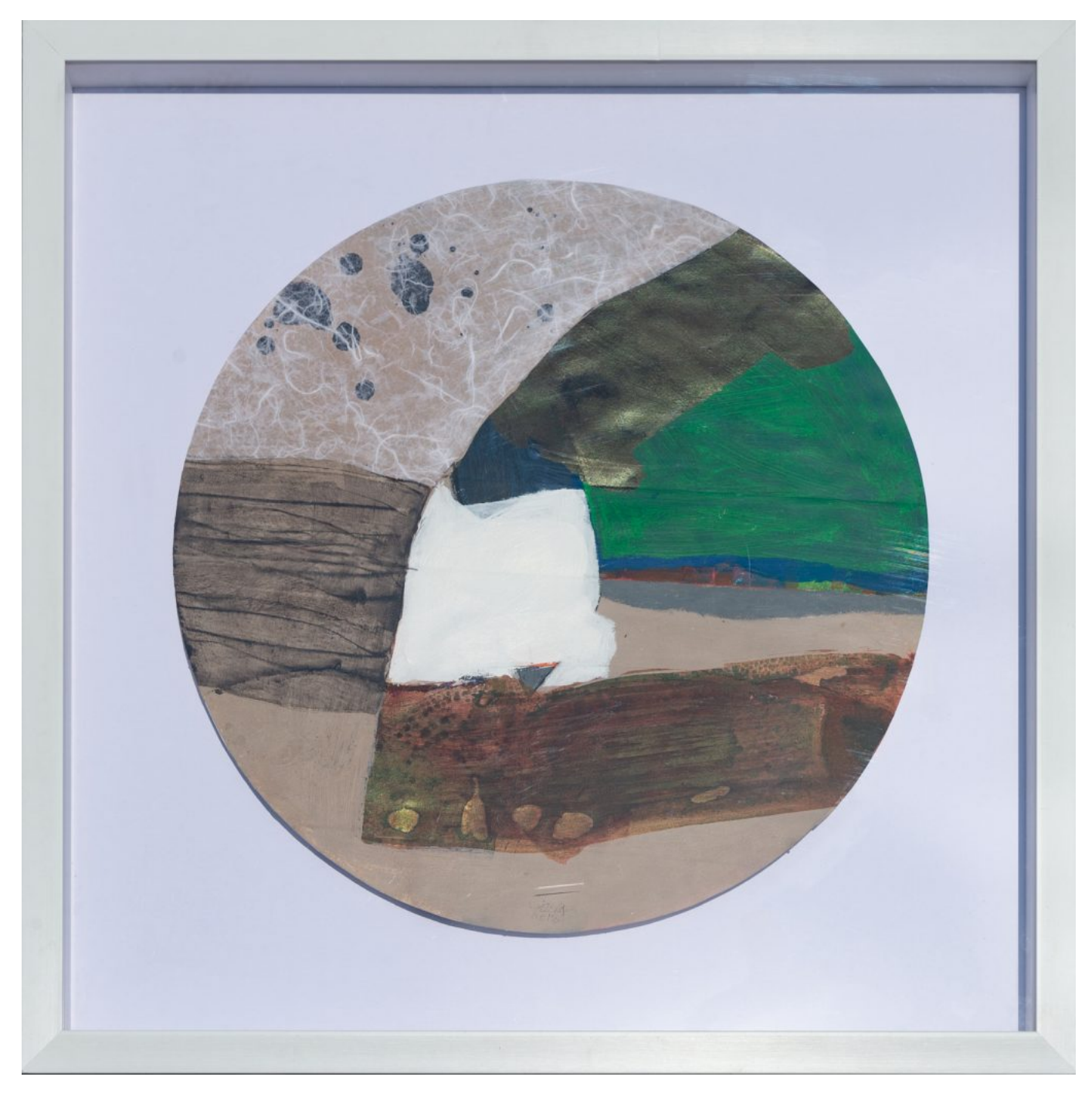
Salman Al-Malek, Times and places collection, 2018, 70 x 70 cm, Courtesy al markhiya Gallery, Doha, Qatar