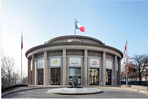
PALAIS D'IÉNA