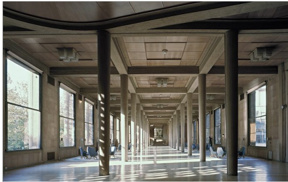
Salle Hypostyle